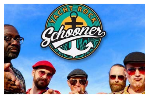
Yacht Rock Schooner Concert 11.22

Journey through Santa's Workshop, the North Pole, and the Island of Misfit Toys at the Center for Puppetry Arts. Visit Puppet.org to purchase tickets.